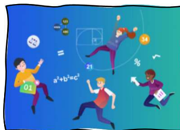
Mathematics and Numeracy