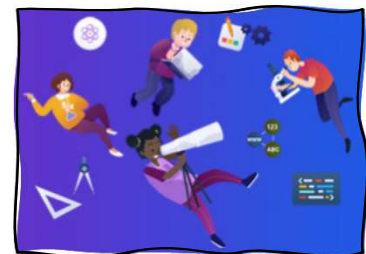
Science and Technology