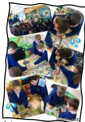
Welsh Water Workshop