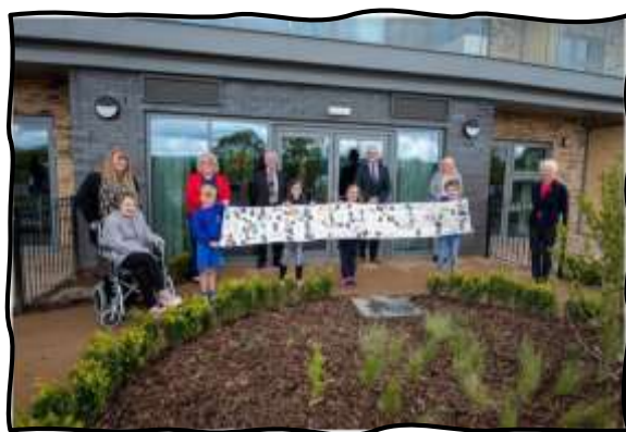
Letter writing and singing for the residents of our local care home in Buckley.