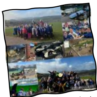
Welsh Mountain Zoo