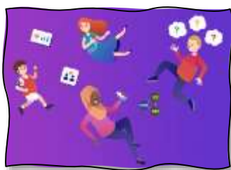
Health and Well-being