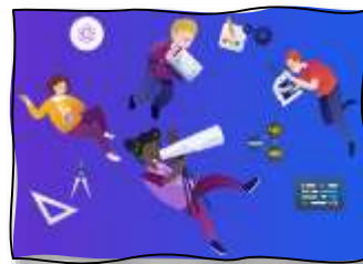
Science and Technology