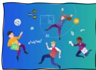
Mathematics and Numeracy