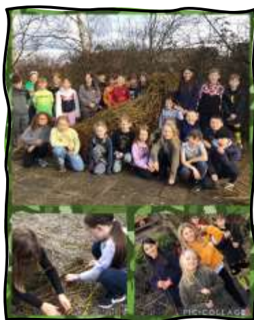
Willow Weaving Workshop