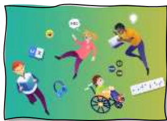
Languages, Literacy and Communication