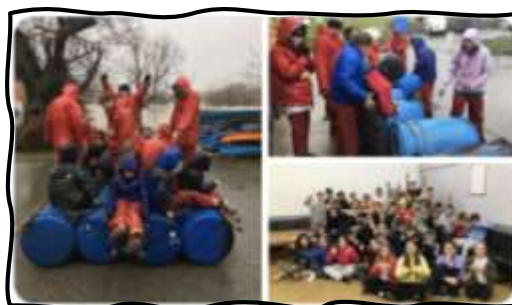
Year 5 and 6 Residential Trips Glanllyn and Nant BH