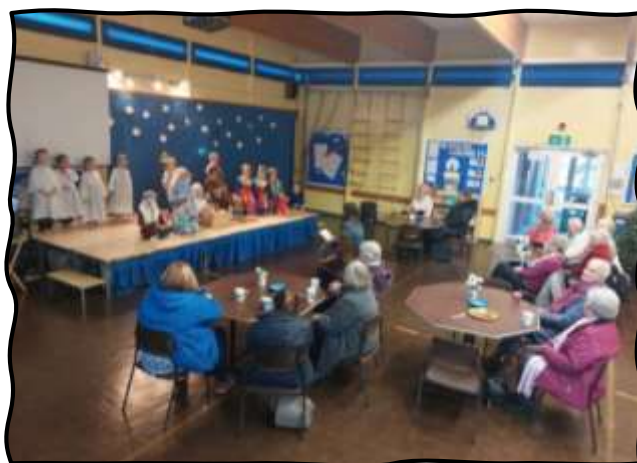
Spreading Christmas cheer